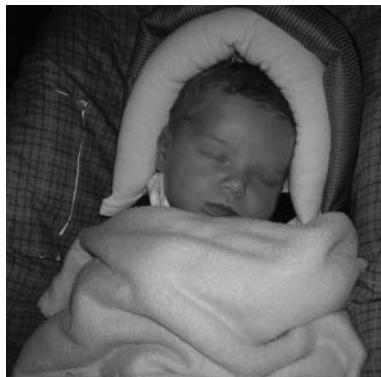
Above: Photos of the little ones born to our PCC mothers.