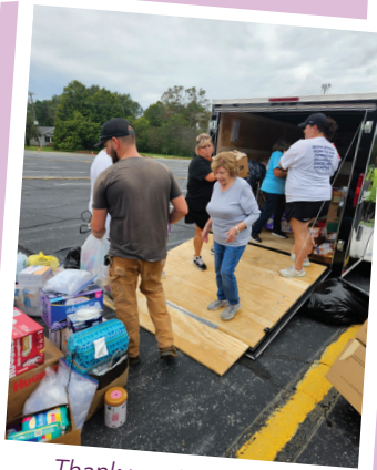
Thank you to our staff, volunteers, and donors for your work in coordinating donations and drop off for Hurricane Helene relief!