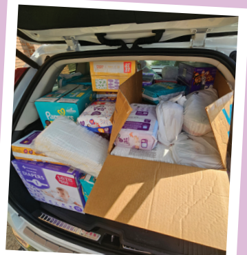
Hurricane Helene relief