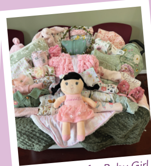
Baby Basket for Baby Girl