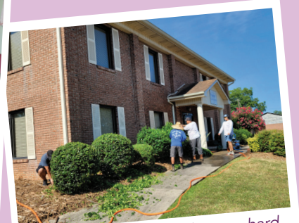
Thank you to ICChurch for your hard work and prayers!