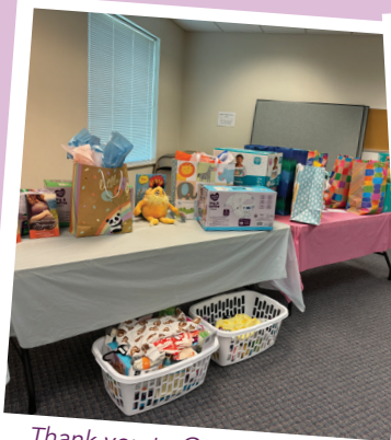
Thank you to Gateway Baptist Church for the wonderful baby shower!