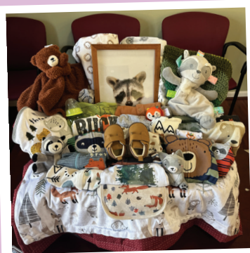
Another Baby Basket