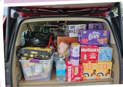
Hurricane Helene relief