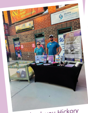
Thank you Hickory Crawdads for having us for non-profit night!

Thank you to this amazing community. You give without measure, and we are truly thankful for your support.