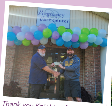
Thank you Knights of Columbus Council #6451 for your help with the Walk For Life!