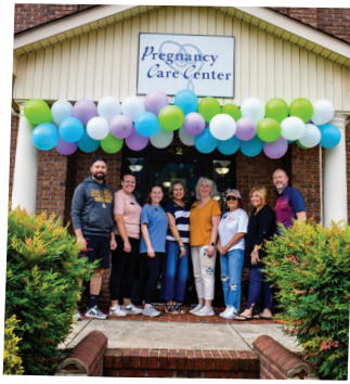
Our staff for Walk For Life!