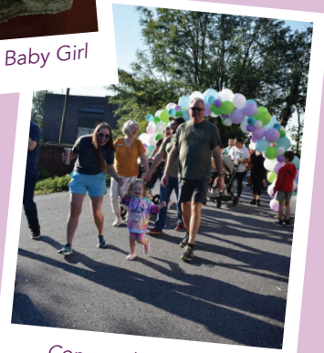
Congratulations to our winning team, Friends For Life, for raising the most money for the Walk For Life!

Thank you to this amazing community. You give without measure, and we are truly thankful for your support.