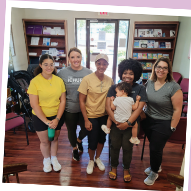
ICChurch service day